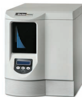
Model H2PEMPD Hydrogen Generator

Parker Balston hydrogen generators meet the strict safety guidelines of the National Fire Protection Agency (NFPA) and the regulations of the Occupational Safety and Health